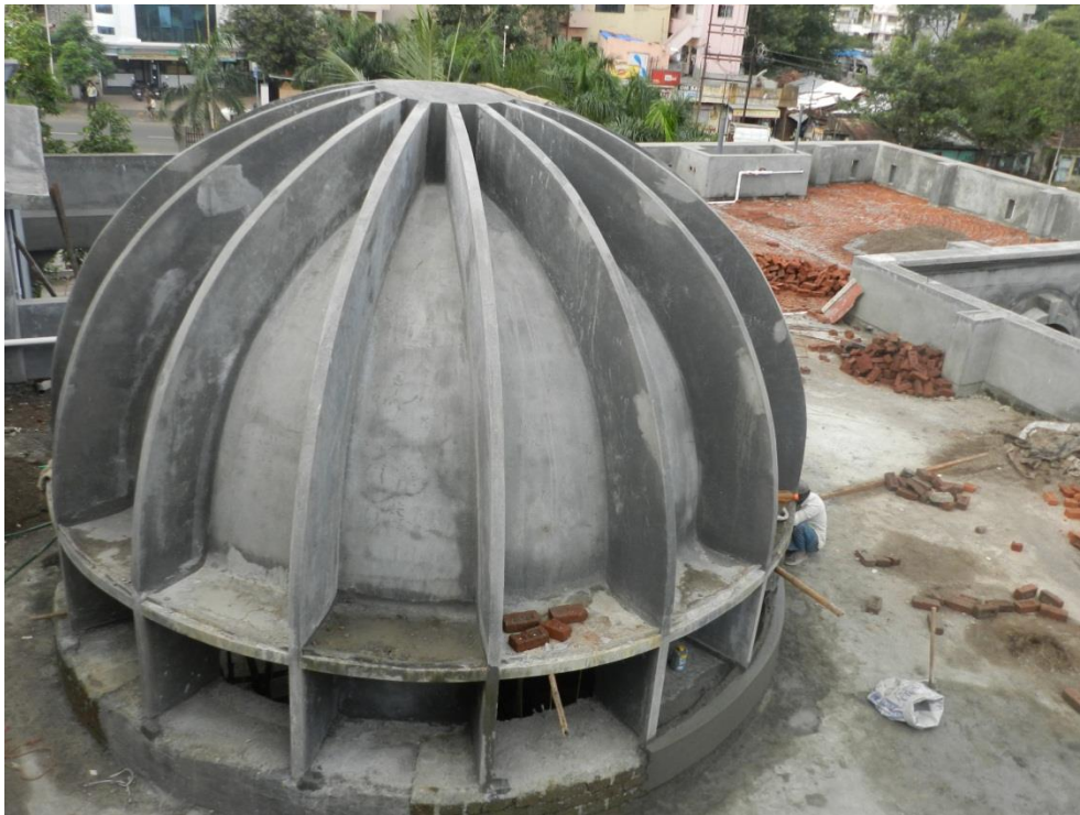
Ferrocement dome near Pune, Maharashtra

In the second part we prepare a thick cement mortar. That is mixing of 1 part cement and 2 parts of fine sand and small quantity of water. We take this thick mortar and press fill it in the chicken-mesh layers. After the press and fill a final finishing and levelling is done using a plate trowel for aesthetics.