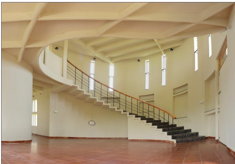
Ferrocement House in Satara Maharashtra

The total steel usage is very limited and used as skeletal steel which offsets the need for formwork and Precious Timber and again structural steel used for formwork of modern RCC structures is majorly eliminated