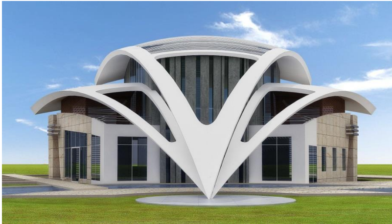
Ferrocement House in Noida